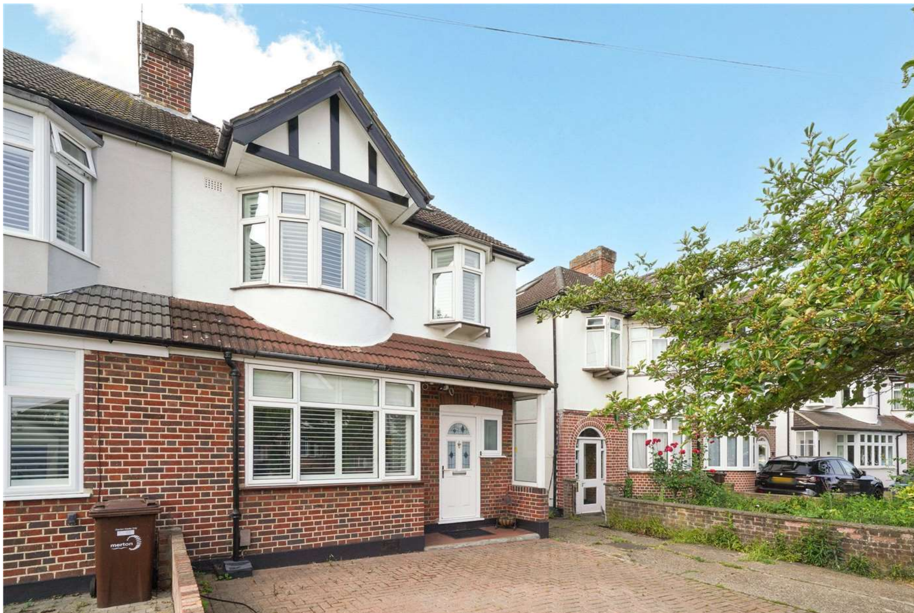
BEAFORD GROVE, SW20 £1,035,000 FREEHOLD