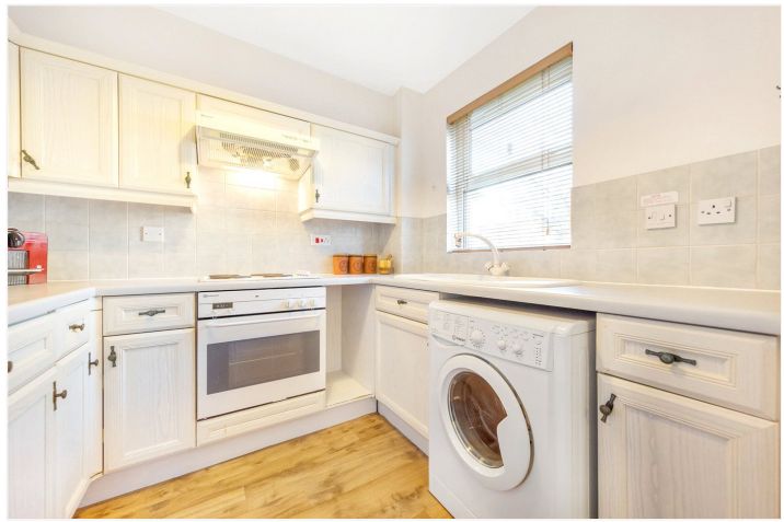
MONMOUTH CLOSE, W4 £1,350 PER MONTH FURNISHED