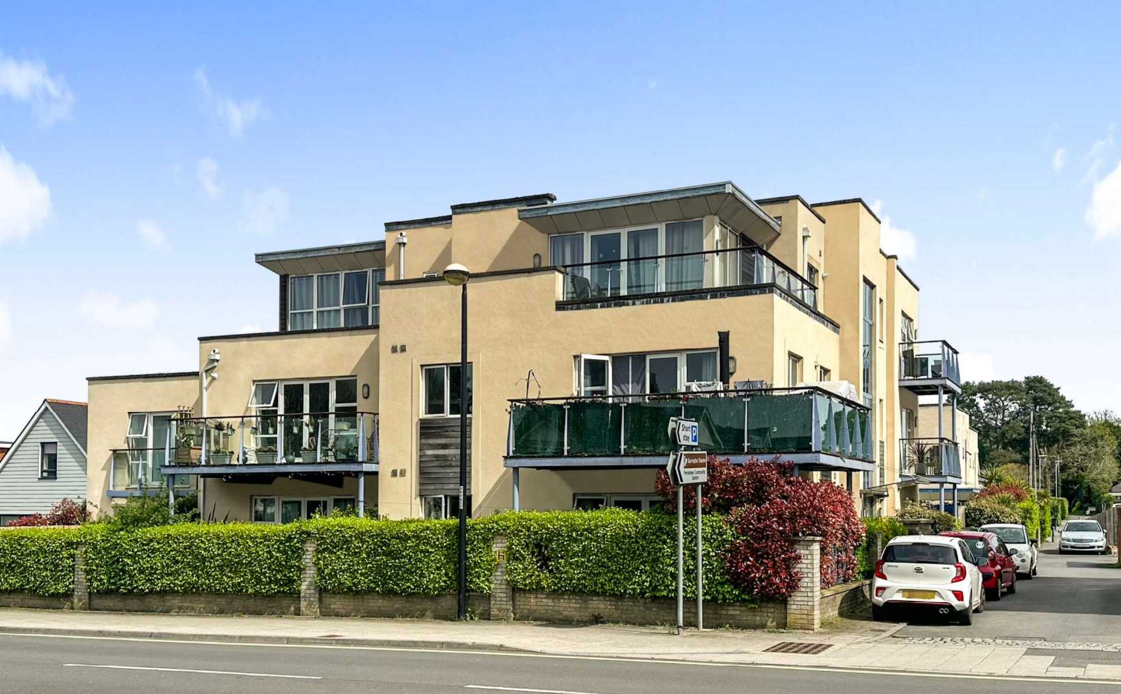
Flat 3, Victoria Place 138 Victoria Road, Ferndown BH22 9JD Guide Price £230,000