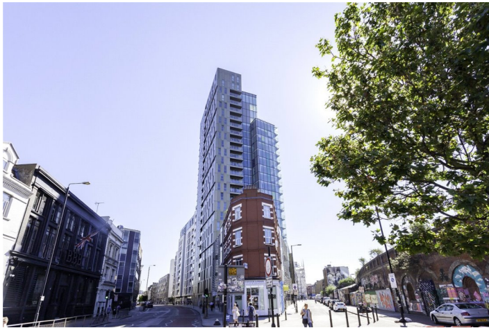
Avantgarde Place, E1 Approx. Gross Internal Floor Area 537 sq. ft / 49.87 sq. m