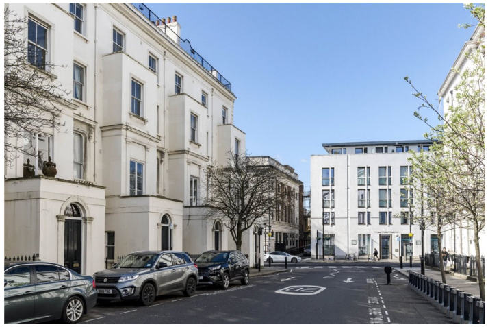
PORCHESTER SQUARE, BAYSWATER, W2 £1,000,000 LEASEHOLD

WITH VIEWS OVER THE STUNNING PORCHESTER SQUARE GARDENS, A WELL-PROPORTIONED, LIGHT, THREE BEDROOM, TWO BATHROOM DUPLEX APARTMENT, SET ON THE THIRD AND FOURTH FLOOR, WITHIN THIS HANDSOME GRADE II STUCCO FRONTED PERIOD BUILDING.