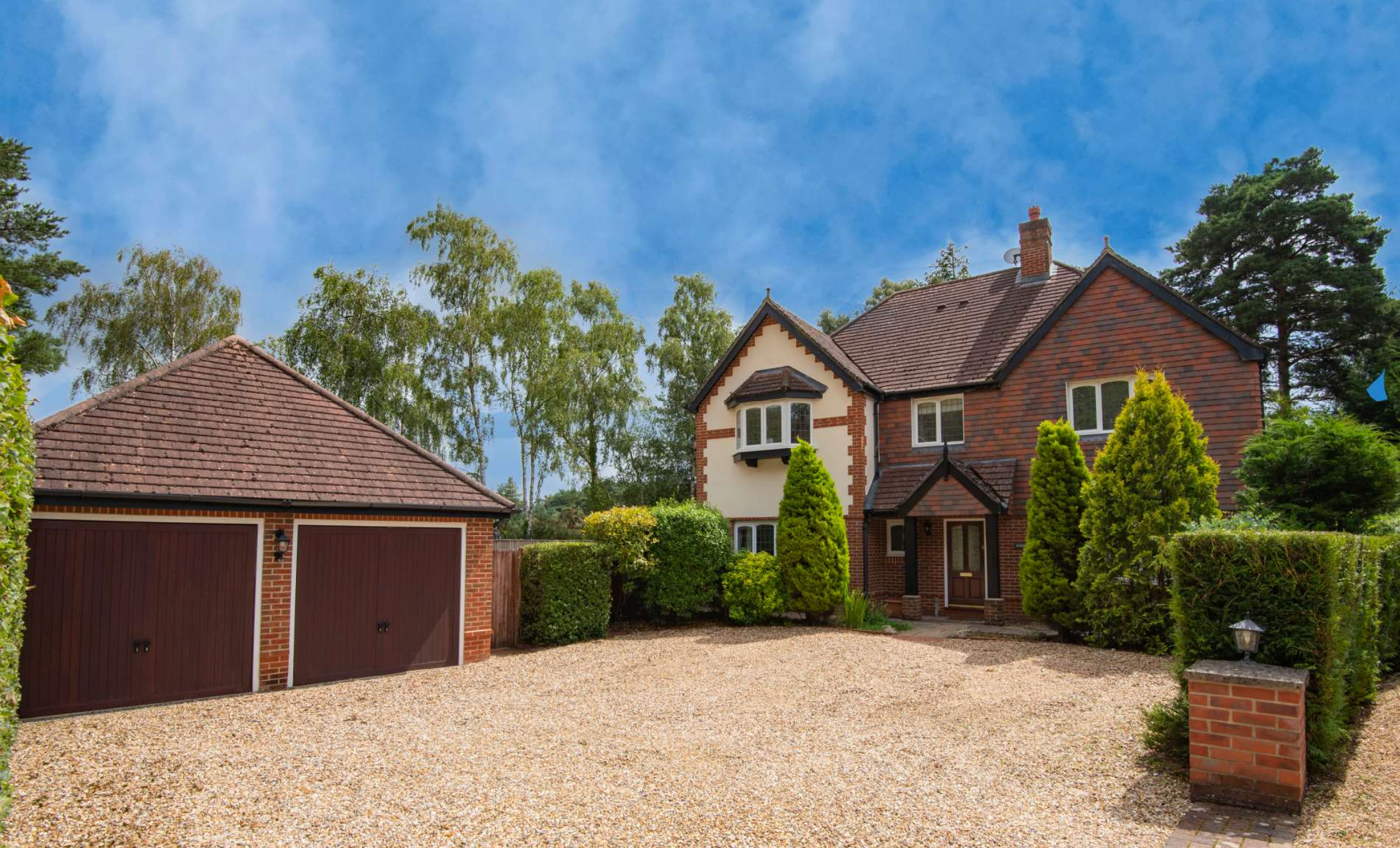
Woodside, 2 Pine Walk West Moors, Ferndown, BH22 0NP GUIDE PRICE £950,000