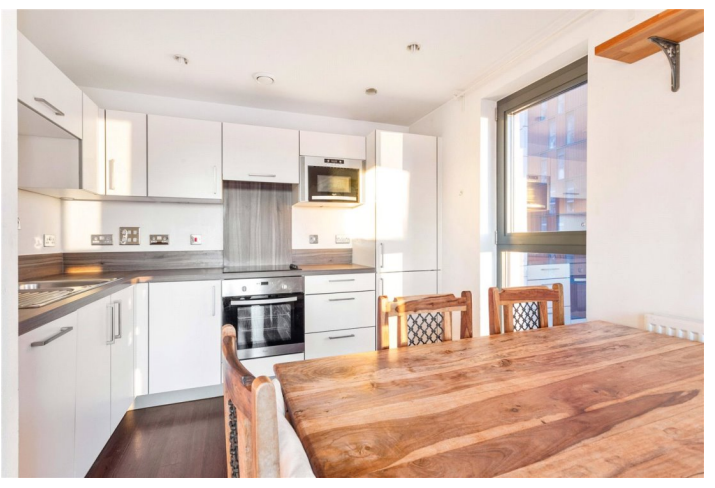
THOMAS TOWER, DALSTON SQUARE, LONDON, E8 £450,000 LEASEHOLD