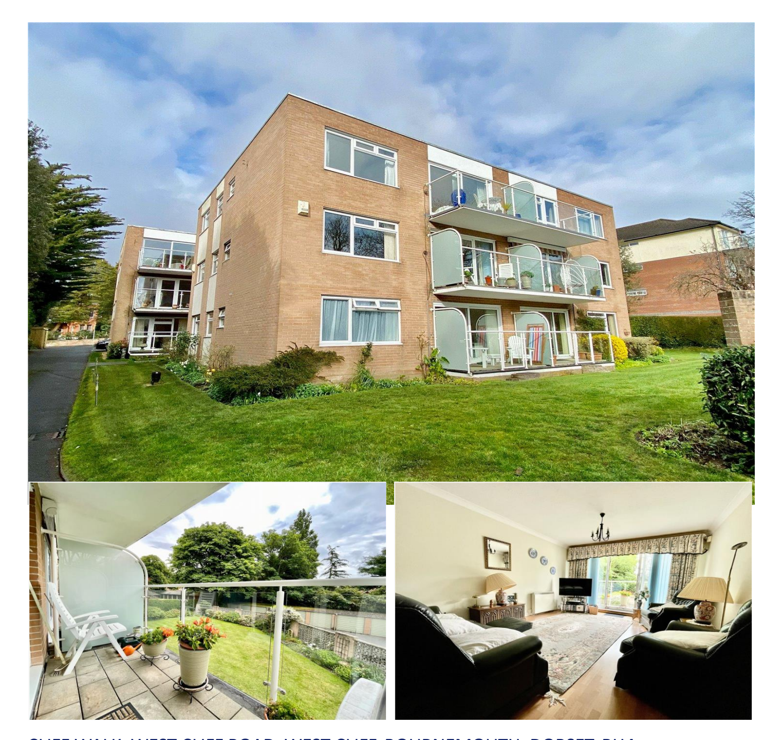
CLIFF WALK, WEST CLIFF ROAD, WEST CLIFF, BOURNEMOUTH, DORSET, BH4