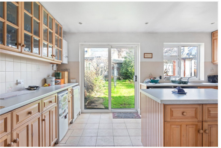
ANSELL ROAD, SW17 £860,000 FREEHOLD