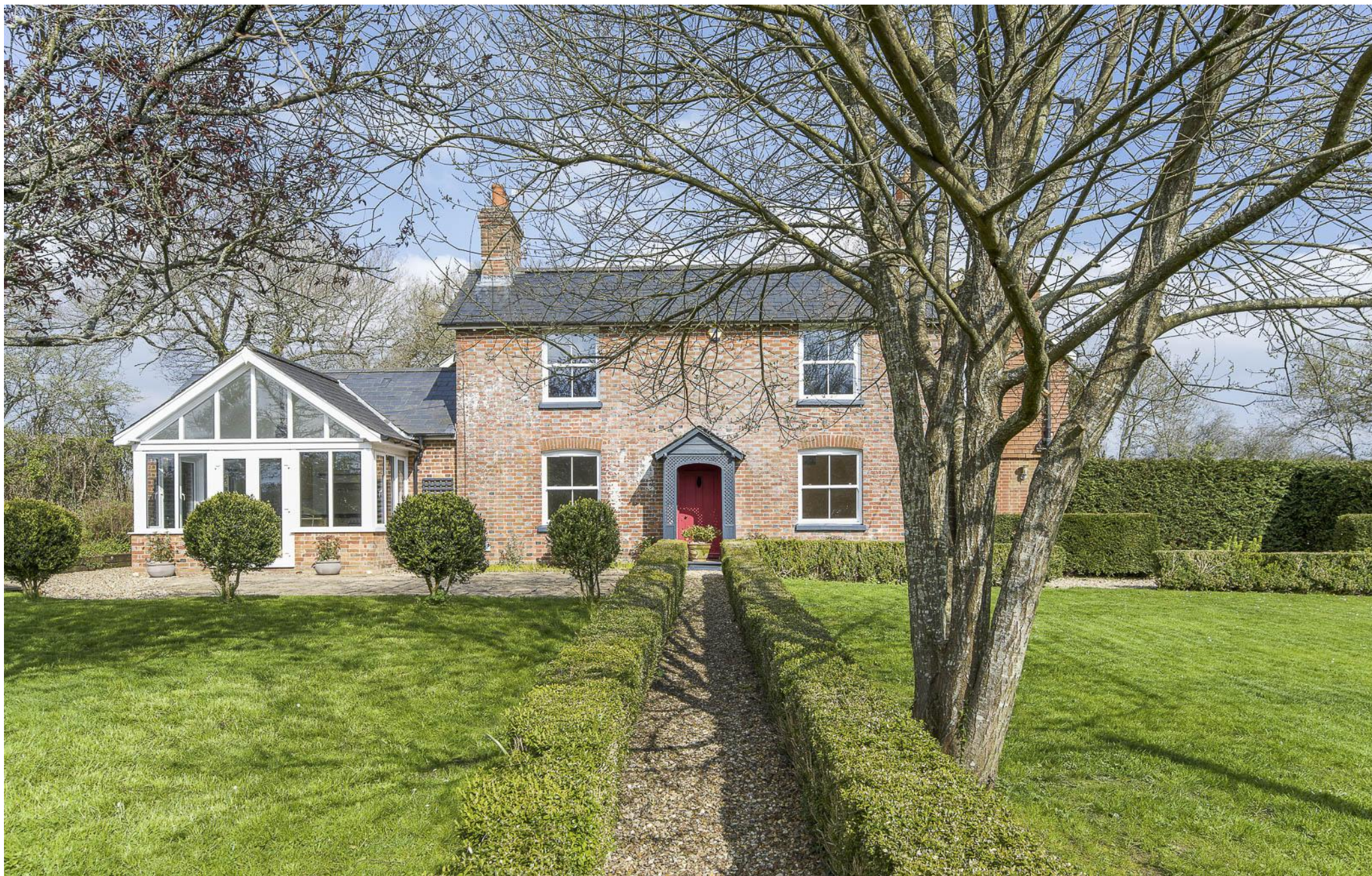
Steplake House, Steplake Lane, Sherfield English, Romsey, SO51 6FR Offers In Excess Of - £1,000,000