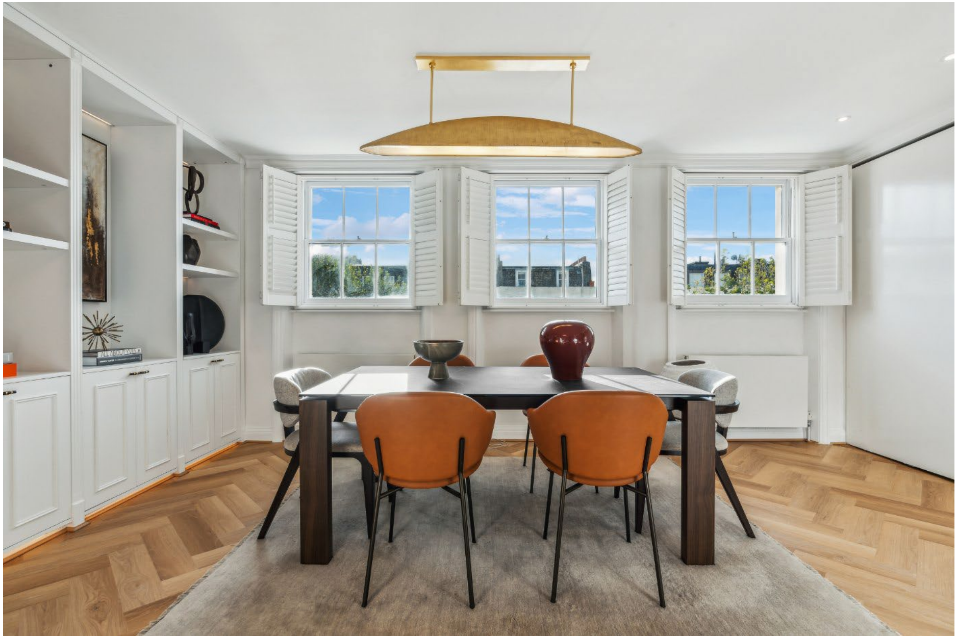
INVERNESS TERRACE, BAYSWATER, W2 £995,000 LEASEHOLD