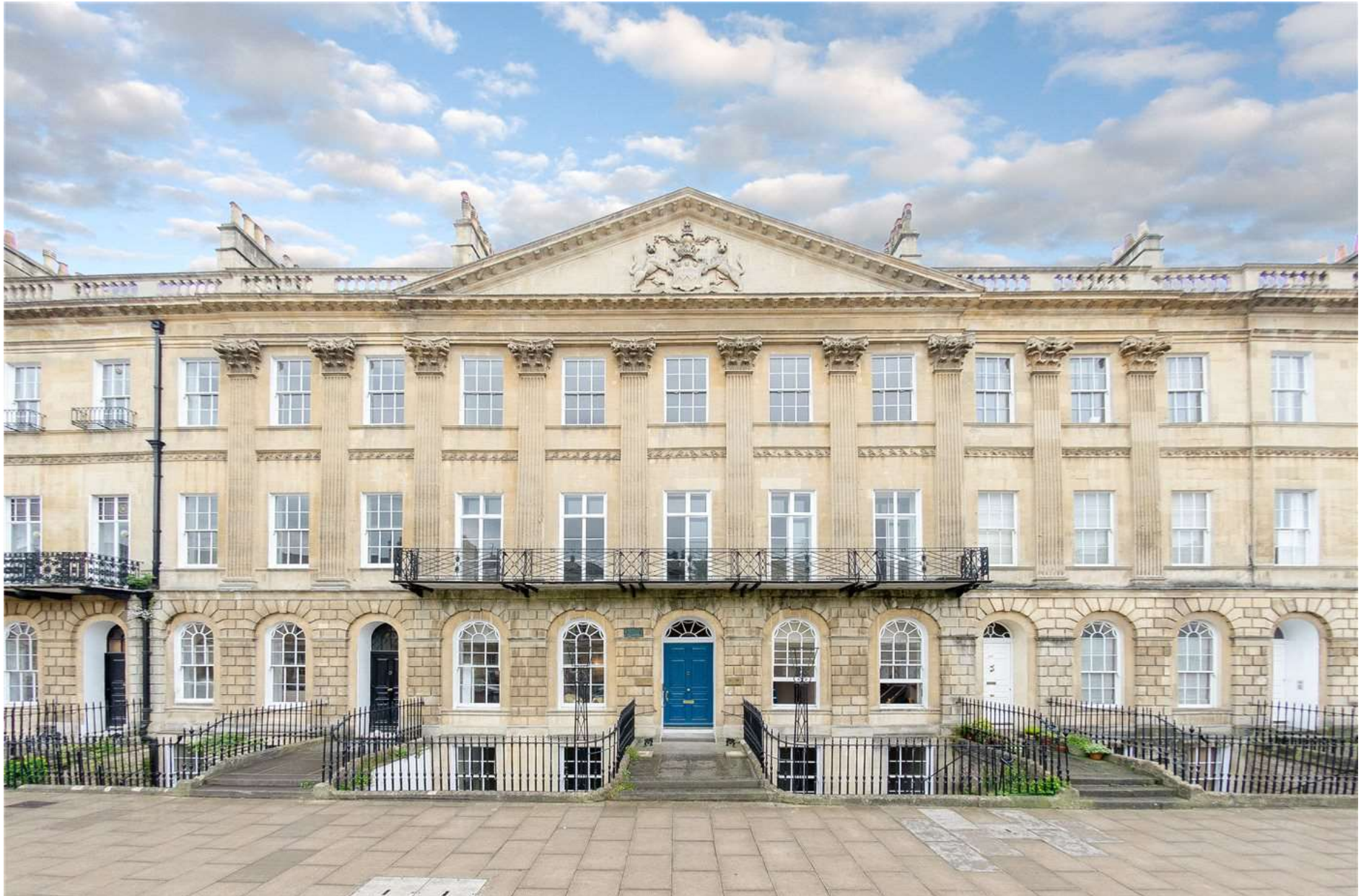
GREAT PULTENEY STREET, BATH, BA2 £400,000 LEASEHOLD