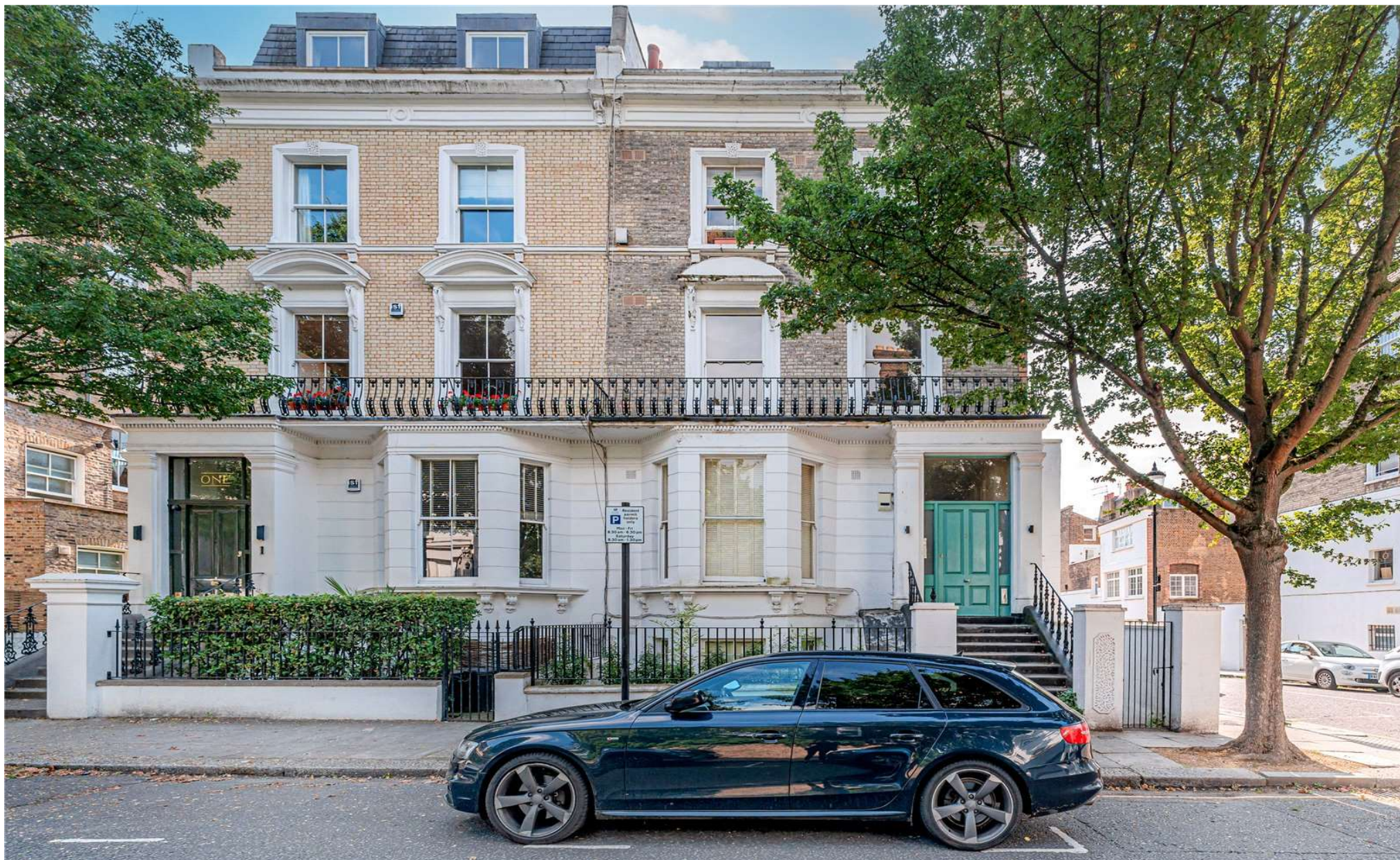
ST. CHARLES SQUARE, W10 £2,100 PER MONTH