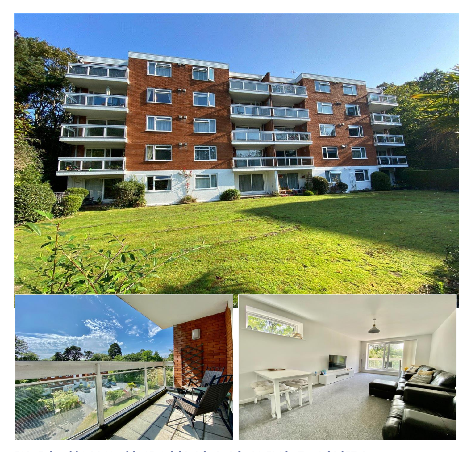
FARLEIGH, 32A BRANKSOME WOOD ROAD, BOURNEMOUTH, DORSET, BH4