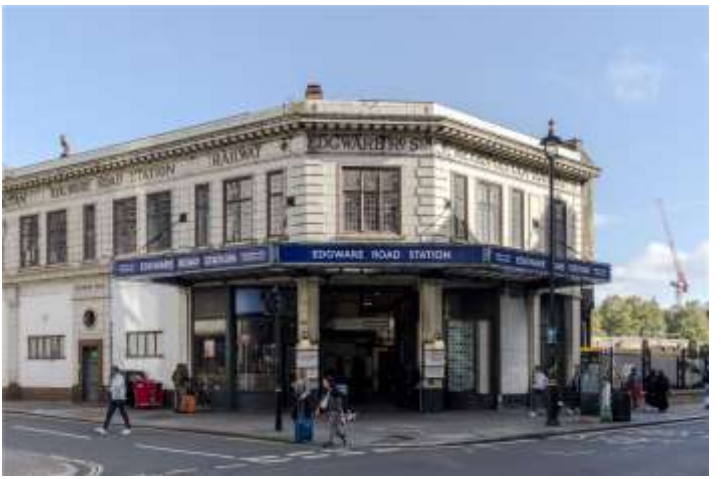
CAMBRIDGE COURT, SUSSEX GARDENS, HYDE PARK ESTATE, W2 OFFERS OVER £295,000 LEASEHOLD

CASH BUYERS ONLY - A WELL-PROPORTIONED, ONE DOUBLE BEDROOM, FOURTH FLOOR (WITH LIFT) APARTMENT WITH ABOUT 51 YEARS REMAINING ON THE LEASE. THE PROPERTY IS IN NEED OF COMPLETE MODERNISATION.