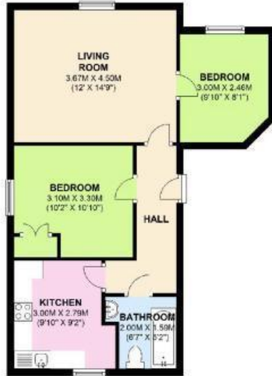
FLAT 5, 11 ELDON SQUARE

This floorplan is for illustration purposes only and is not to scale. The position and size of doors, windows, appliances and other features are approximate.