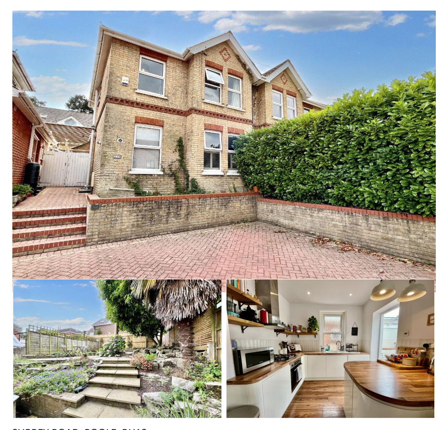
SURREY ROAD, POOLE, BH12