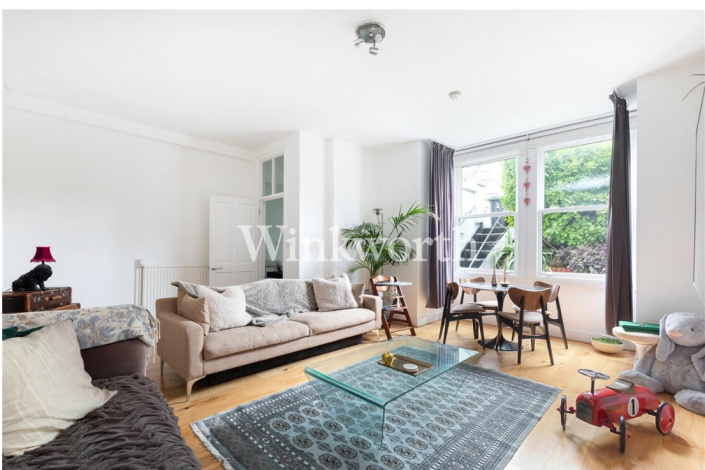
ENDYMION ROAD, N4 £500,000 SHARE OF FREEHOLD