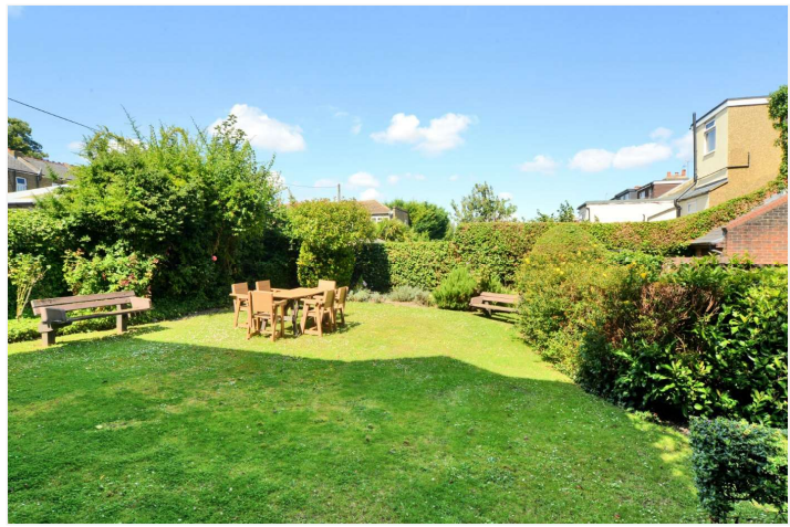
STATION ROAD, SUTTON, SM2 £97,000 LEASEHOLD

A RECENTLY DECORATED AND RE-CARPETED GROUND FLOOR RETIREMENT APARTMENT WITH SHARED PATIO SITUATED CLOSE TO SEVERAL TRANSPORT LINKS