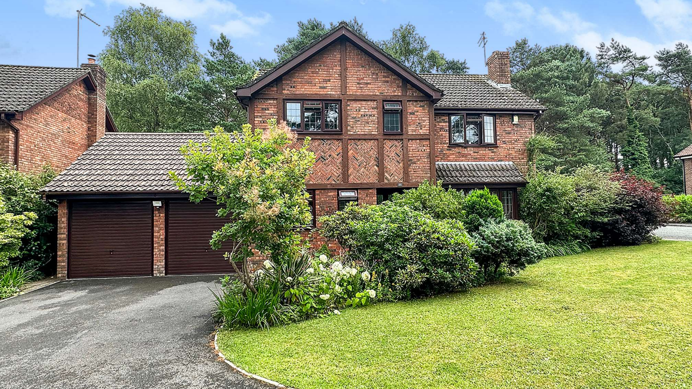
27 Redwood Drive Ferndown, BH22 9UG Guide Price £650,000