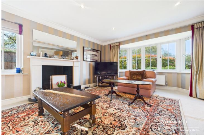
SILCHESTER PLACE, READING, BERKSHIRE, RG7 1GX £650,000 FREEHOLD