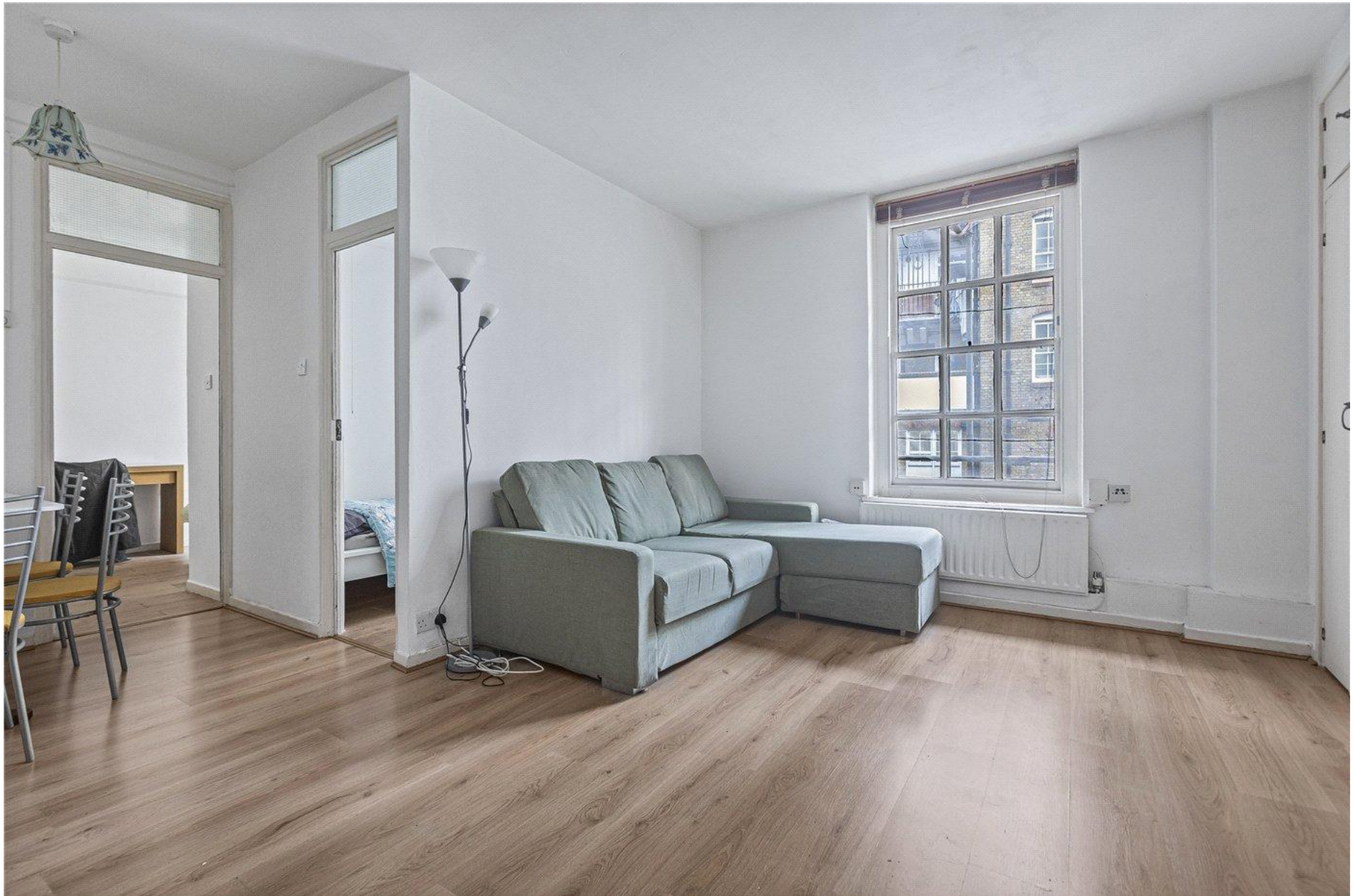
BOURNE ESTATE, LONDON, EC1 £525,000 LEASEHOLD