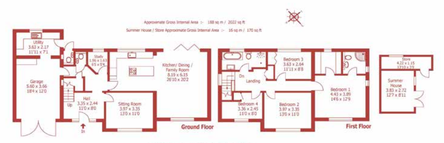
For identification purposes only, not to scale, do not scale