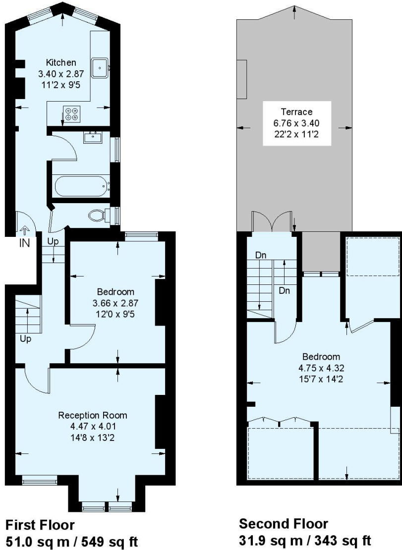
First Floor 51.0 sq m / 549 sq ft