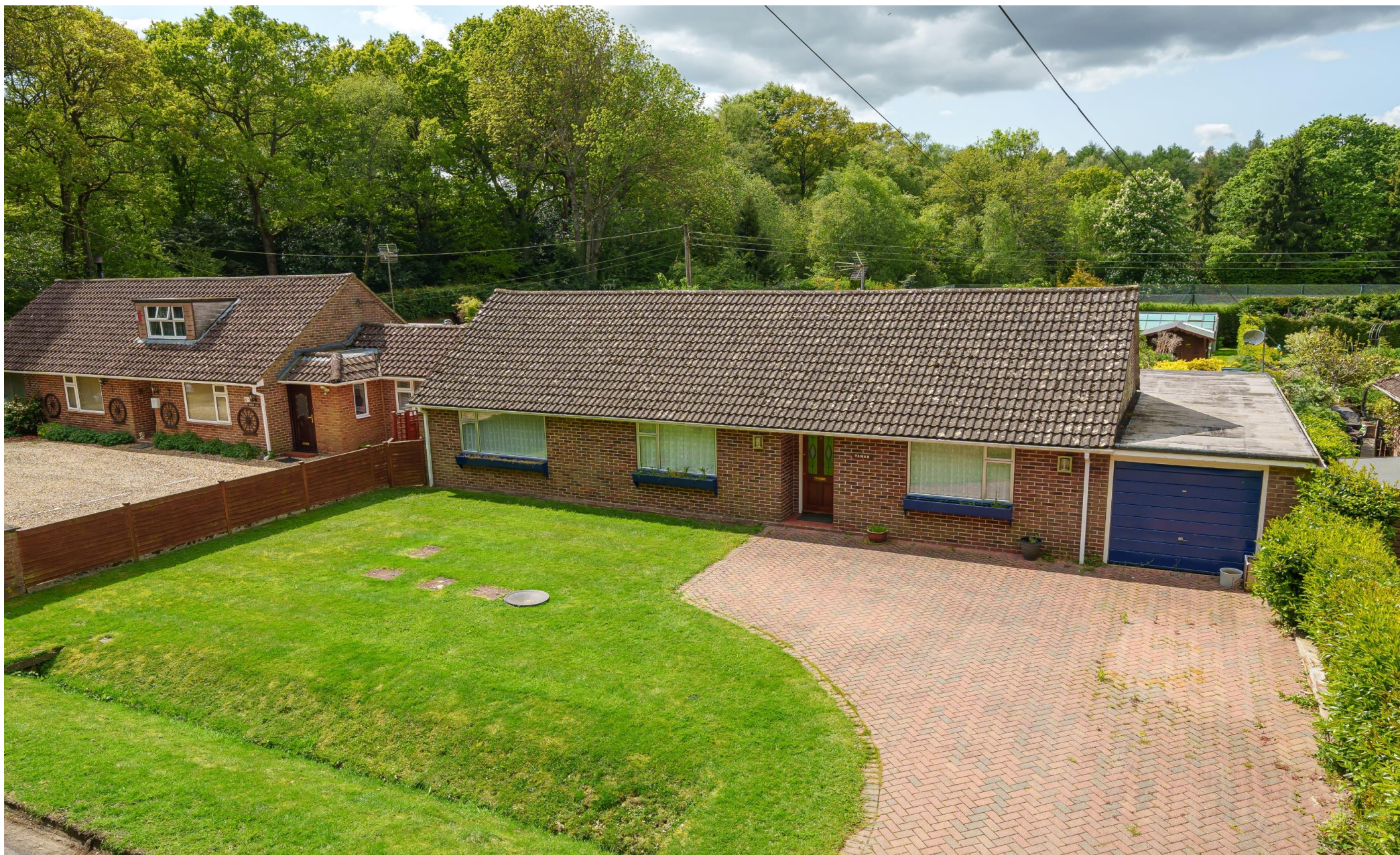
Wolverton Common Tadley Hampshire RG26 5RY