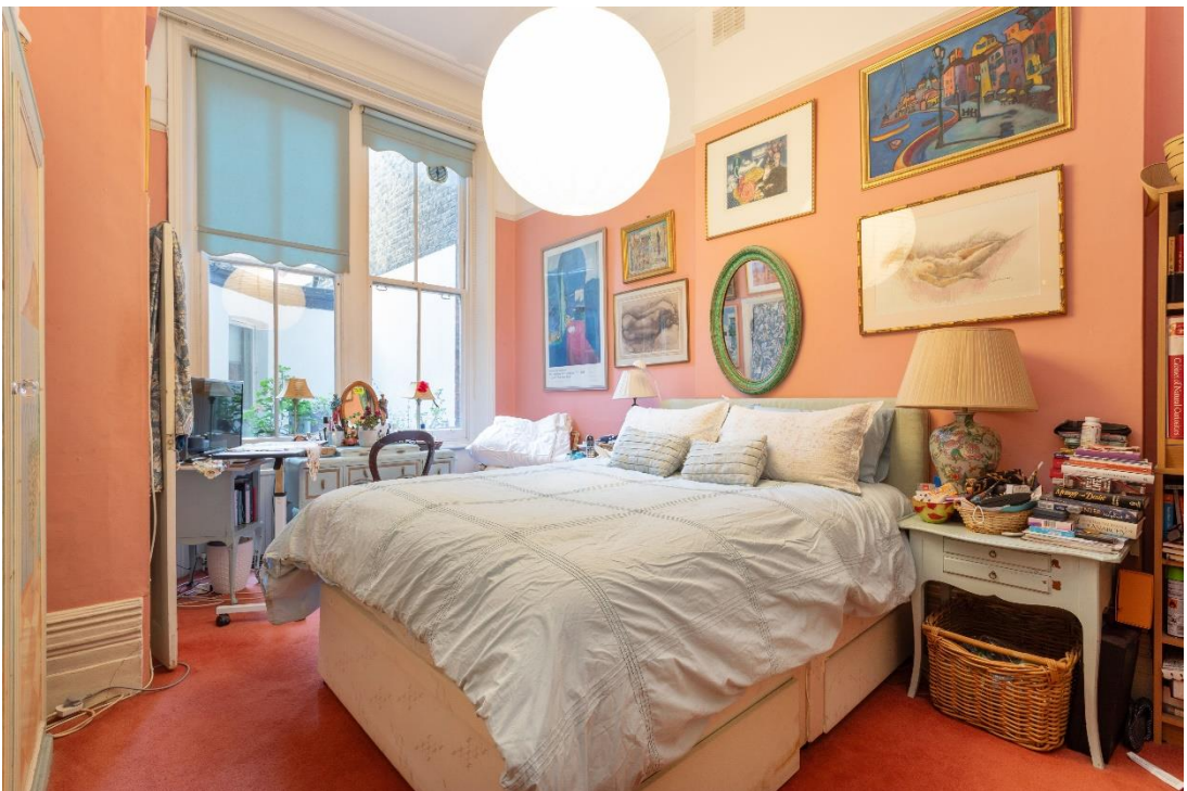
Raised Ground Floor | Private Garden Square | Share of Freehold