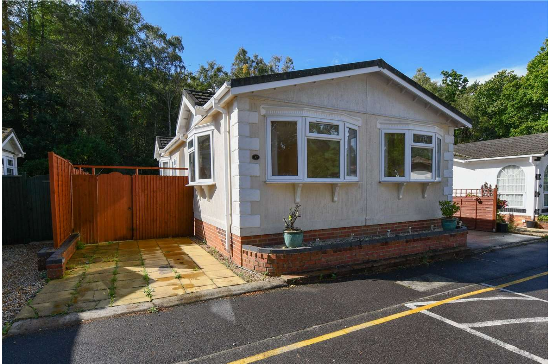
37 CALIFORNIA COUNTRY PARK HOMES, NINE MILE RIDE, FINCHAMPSTEAD, RG40 4HT £199,950