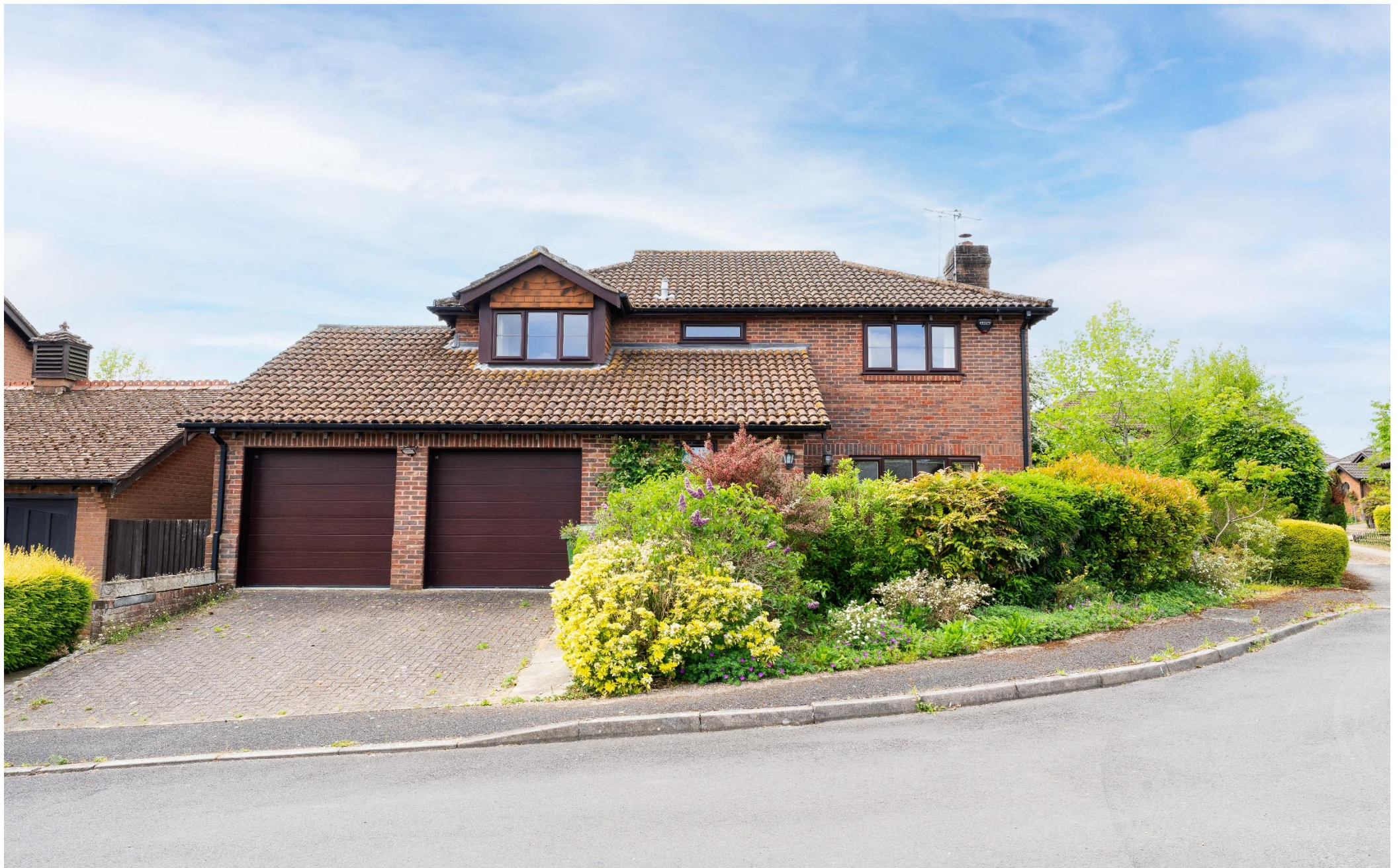
5 Old Cottage Close, West Wellow, Romsey SO51 6RL