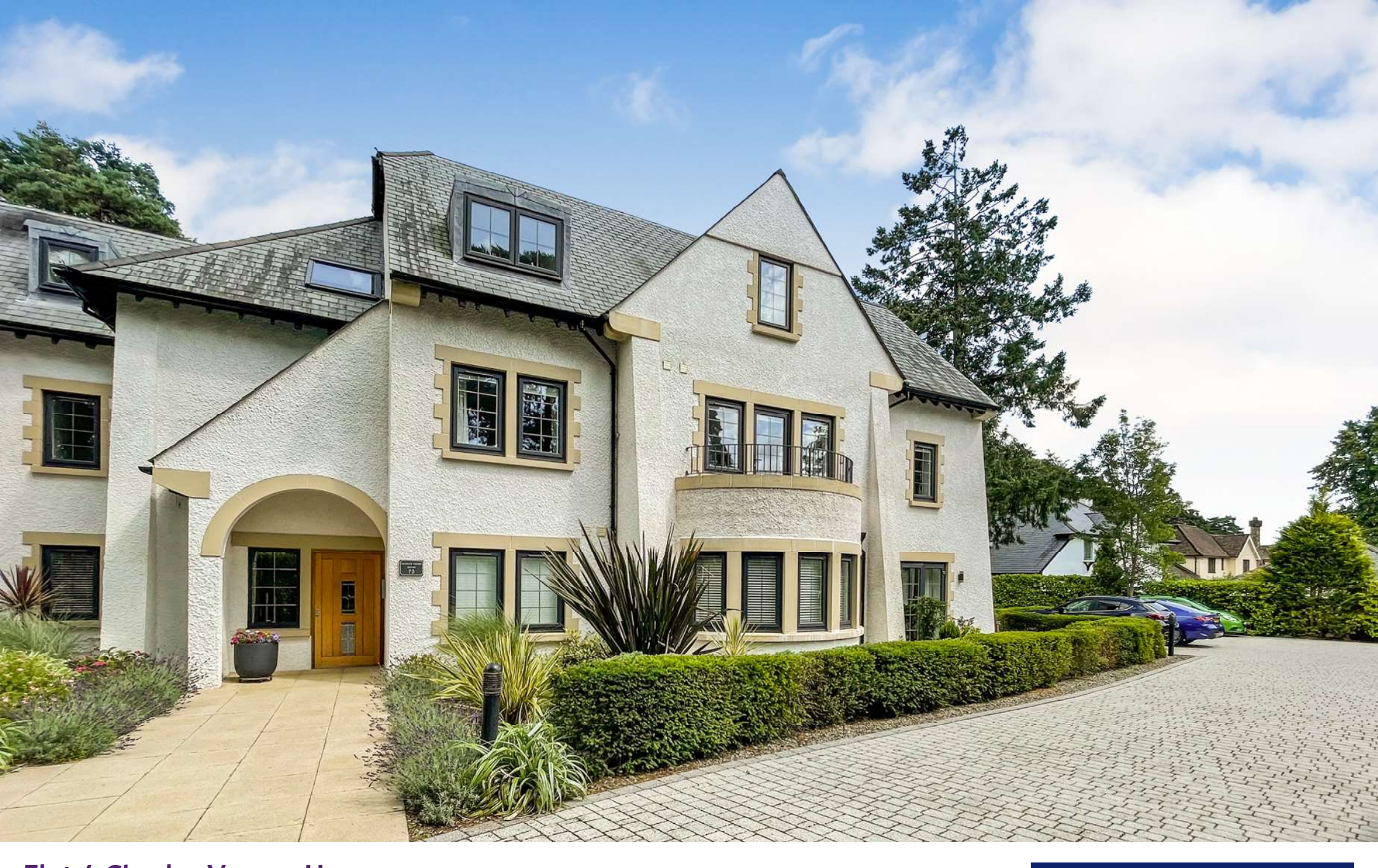
Flat 4 Charles Voysey House 73 Golf Links Road, Ferndown BH22 8BU Guide Price £400,000