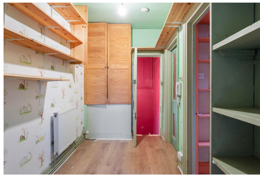
Un-modernised | Leasehold | Split-level