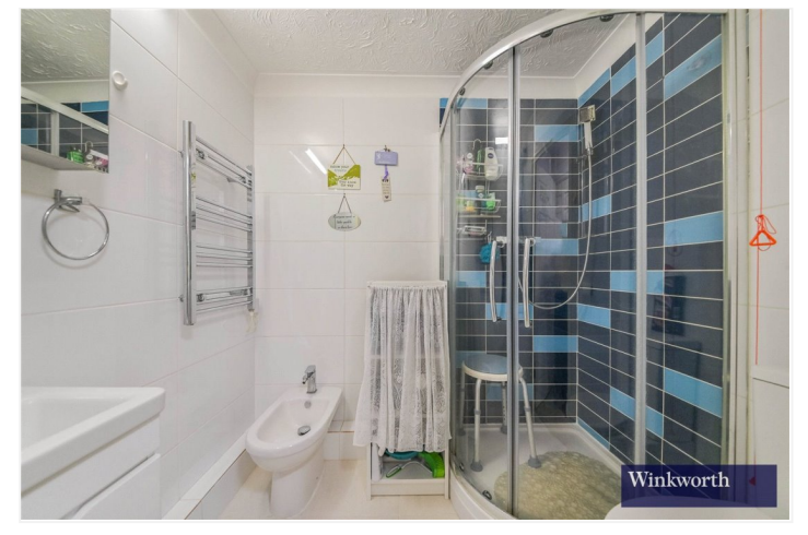
Book your viewing now!

Further benefits include, but are not limited to close proximity to both Northwick Park and Harrow-on-the-Hill underground Stations, well-kept gardens to the rear of the development, resident's parking and an onsite development manager. You can also take advantage of Central Harrow's shopping amenities with St Ann's and St George's Shopping Centres located a stone's throw away.