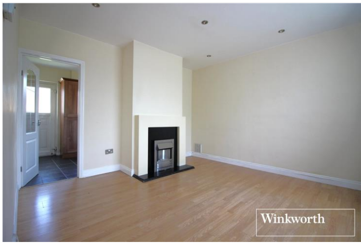
WENTBRIDGE PATH, HERTFORDSHIRE, WD6 £400,000 FREEHOLD