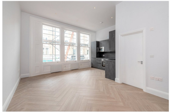
LADBROKE GROVE, LONDON, W10 £2,250 PER MONTH