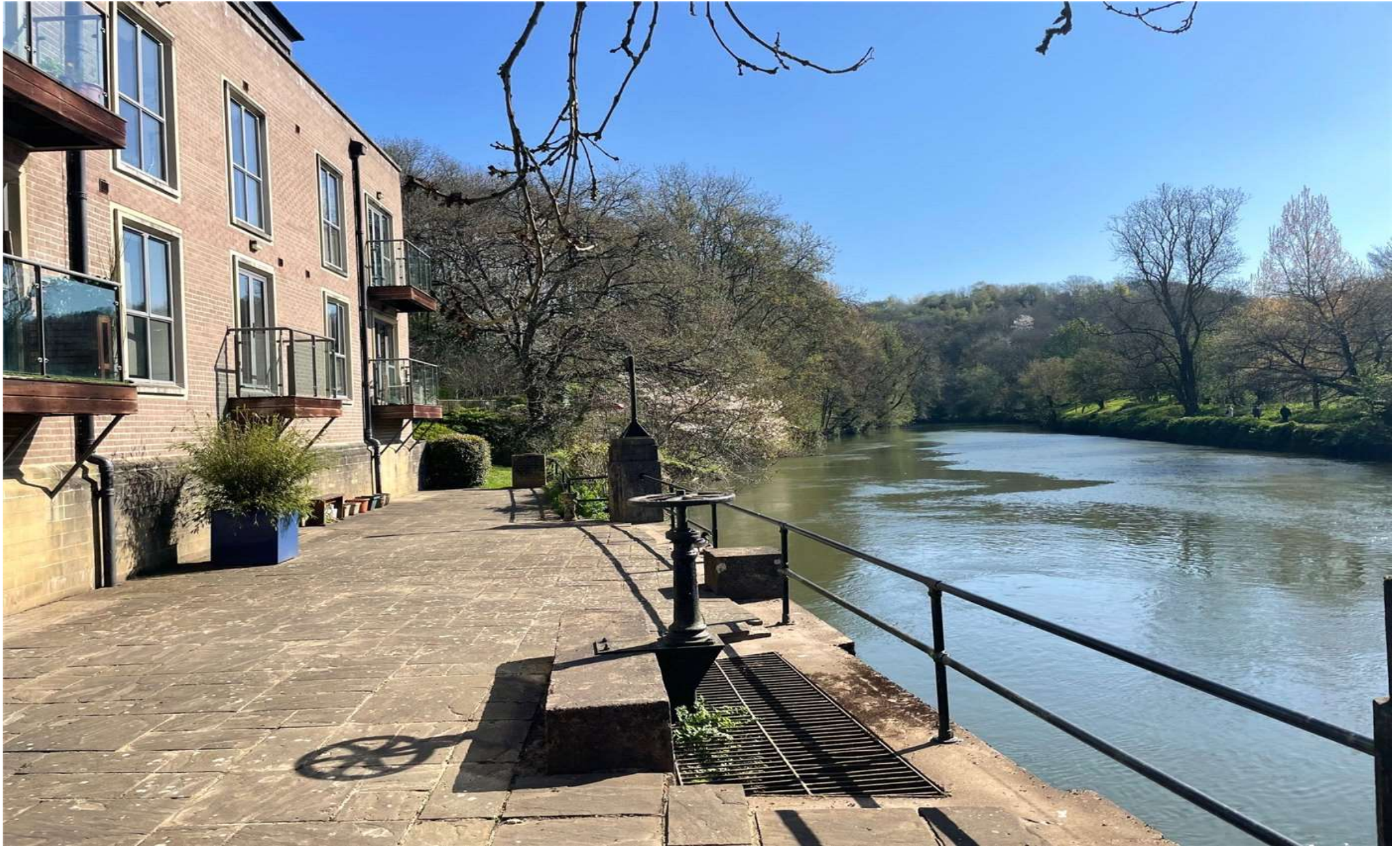
THE PUMP HOUSE, PUMP HOUSE LANE, ST.ANNES, BS4 £295,000 LEASEHOLD