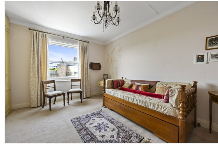
LEXHAM GARDENS, W8 £795,000 SHARE OF FREEHOLD

A BRIGHT AND SPACIOUS (808 SQ FT/75 SQ M) TWO BEDROOM FLAT SITUATED ON THE FOURTH FLOOR OF A BROAD VICTORIAN TERRACED HOUSE.