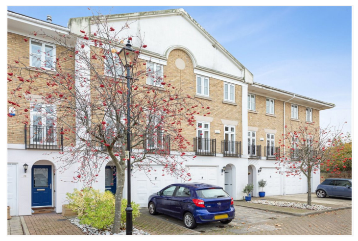
BEVIN SQUARE, SW17 £1,175,000 FREEHOLD