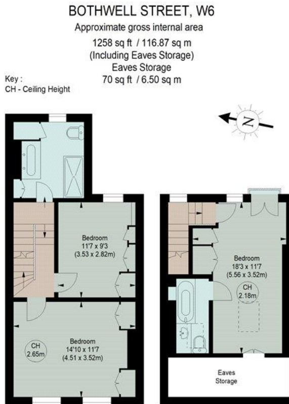
FIRST FLOOR (39.84 m²)