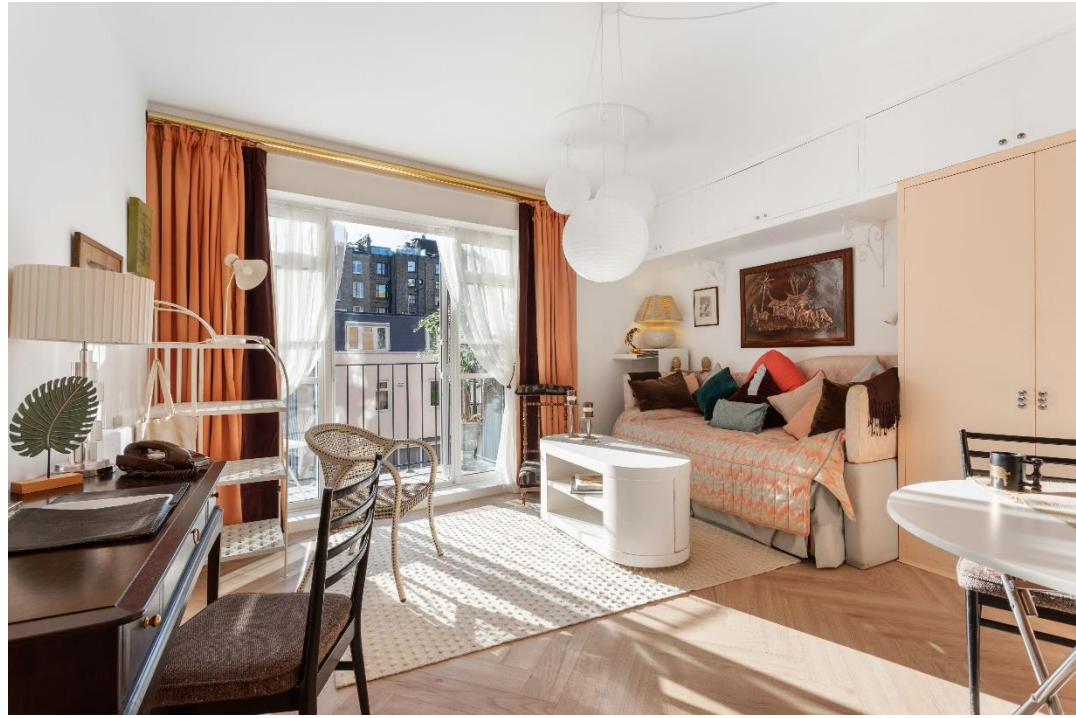
Studio | first floor | Lift | balcony