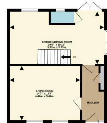
GROUND FLOOR 433 sq.ft. (40.2 sq.m.) approx.