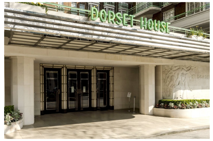
DORSET HOUSE, GLOUCESTER PLACE, MARYLEBONE, NW1 £695,000 LEASEHOLD

LOCATED ON THE EIGHTH FLOOR, A LONG LEASE, LIGHT AND WELL-PROPORTIONED ONE BEDROOM APARTMENT, IN THIS STRIKING AND HIGHLY SOUGHT AFTER, GRADE II ART DECO MARYLEBONE PORTERED BUILDING.