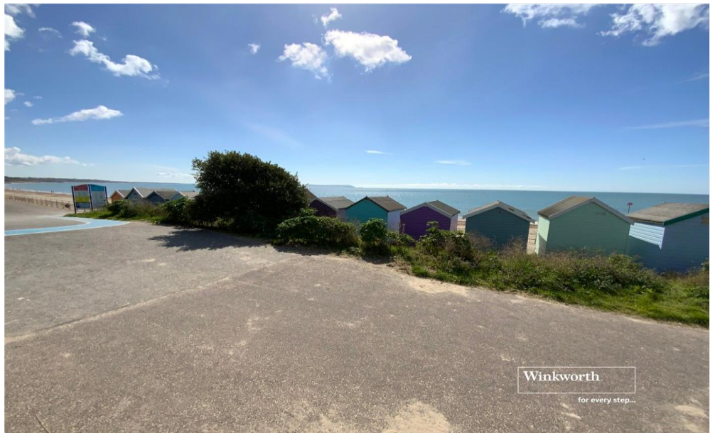
BEACH HUT 155, FRIARS CLIFF, CHRISTCHURCH PRICE: £79,950