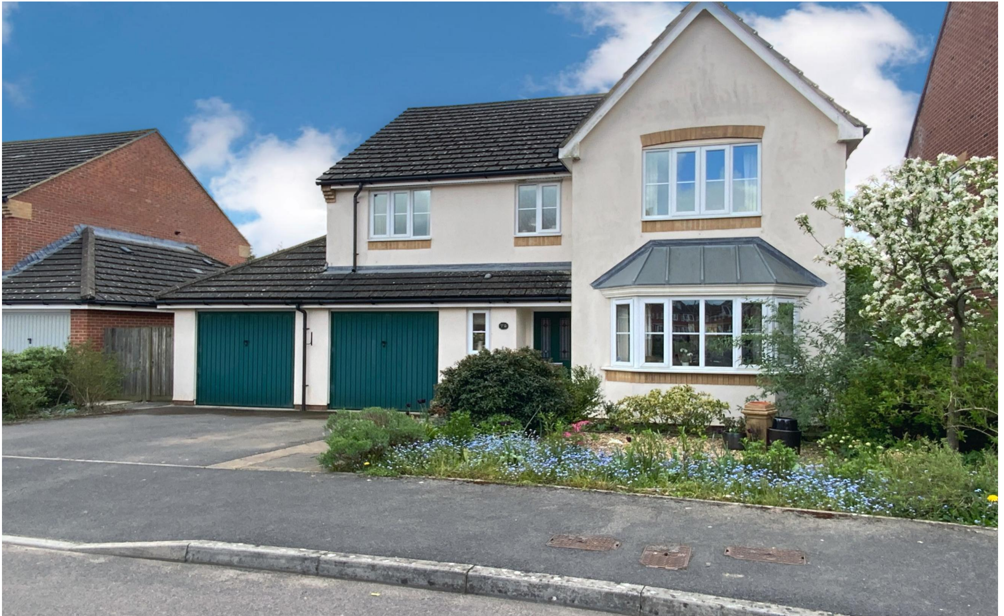
FRUITFIELDS CLOSE, DEVIZES, WILTSHIRE, SN10 £530,000