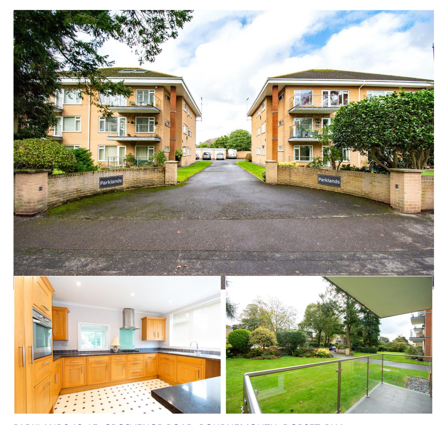
PARKLANDS 13-15, GROSVENOR ROAD, BOURNEMOUTH, DORSET, BH4