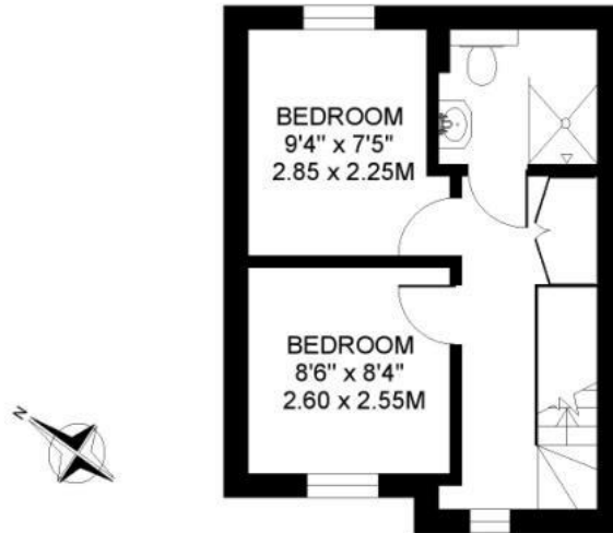
SECOND FLOOR 275 SQ.FT.

Approximate gross floor area 953 SQ.FT / 88.5 SQ.M.