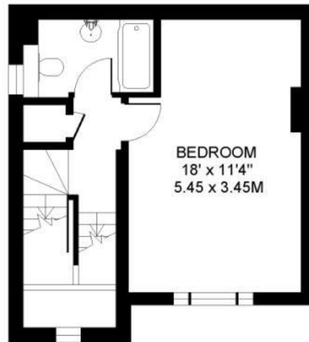
FIRST FLOOR 340 SQ.FT.

This floorplan is for illustration purposes only and is not to scale. The position and size of doors, windows, appliances and other features are approximate.