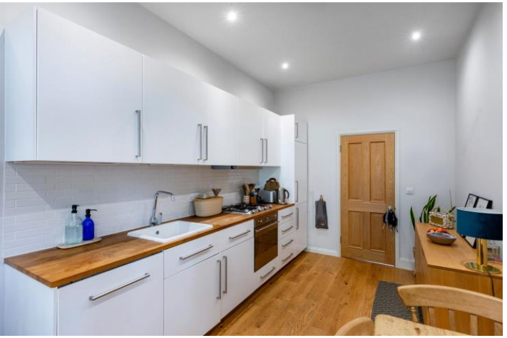
CASEWICK ROAD, LONDON, SE27 £500,000 LEASEHOLD