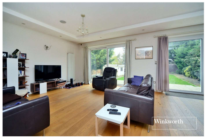
THE WARREN, WORCESTER PARK, SURREY, KT4 £850,000 FREEHOLD

A SPACIOUS FOUR BEDROOM, THREE BATHROOM BUNGALOW SET IN A PRIVATE ROAD WITH A CIRCA 70FT REAR GARDEN AND OPEN-PLAN LIVING SPACE