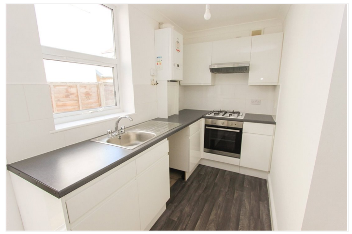
WESTBOROUGH ROAD, ESSEX, SSO £1,100 PER MONTH UNFURNISHED