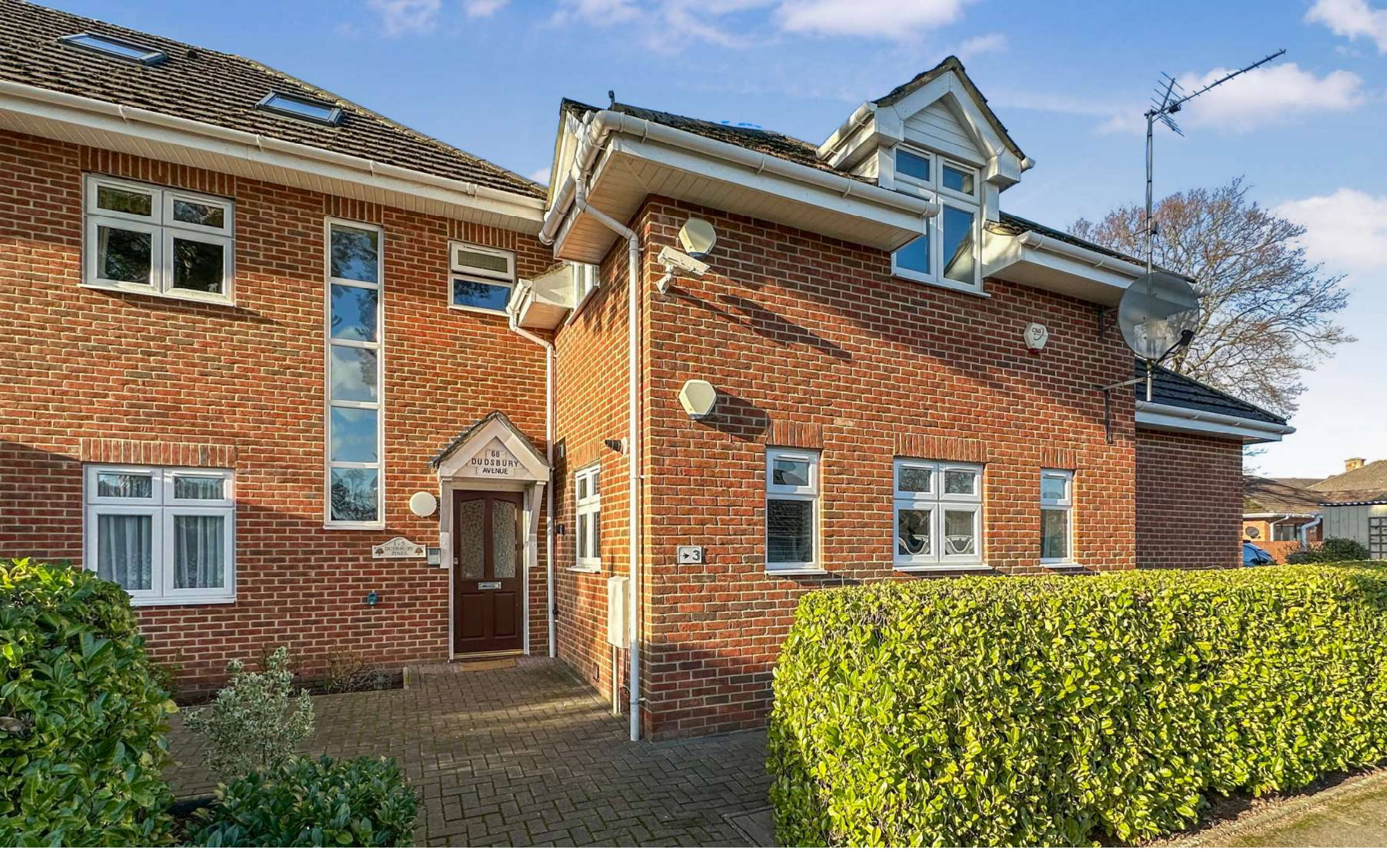
Flat 2, Dudsbury Pines, 68 Dudsbury Avenue, Ferndown BH22 8DQ Guide Price £255,000