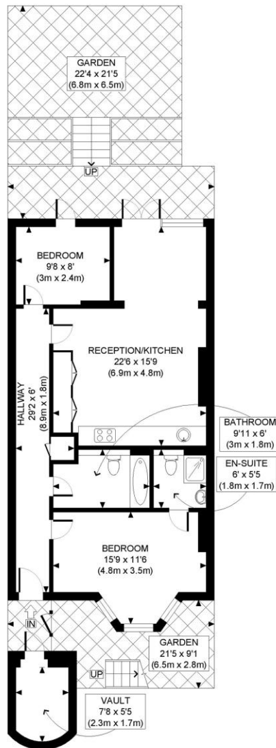
LOWER GROUND FLOOR GROSS INTERNAL FLOOR AREA 755 SQ FT

APPROX. GROSS INTERNAL FLOOR AREA WITH VAULT: 799 SQ FT/ 74 SQM APPROX. GROSS INTERNAL FLOOR AREA WITHOUT VAULT: 755 SQ FT/ 70 SQM