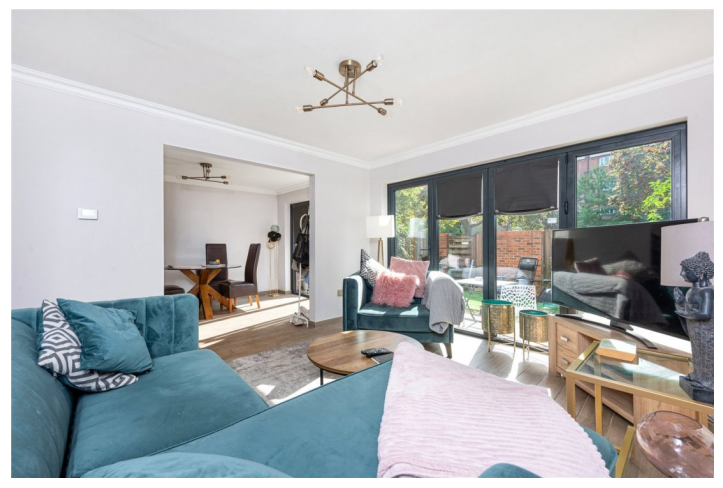
MARY SEACOLE CLOSE, CLARISSA STREET, LONDON, E8 £885,000 FREEHOLD